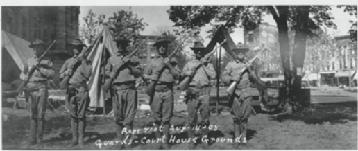
AUG-14-08 Guards - Court House Grounds